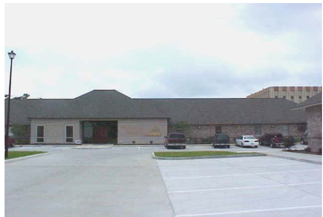
Main Office Building in the Celtic Centre Complex

So the next time you are in the area, stop by and visit us at our new home. Need directions? Give us a call at (225) 752-2490. We look forward to seeing you soon.